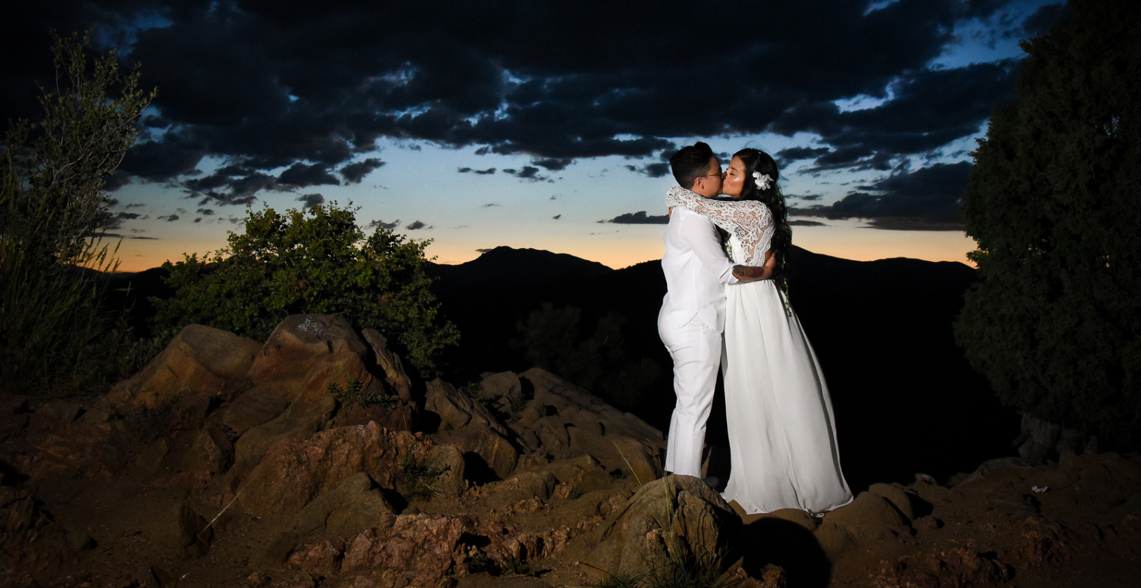
Capture your Elopement & Love Simply designed to fit you!

Elopements include an in-depth questionnaire and consultation for designing your session. 2 hour elopement session. All final digital image on a flash drive. Online gallery. Print release.